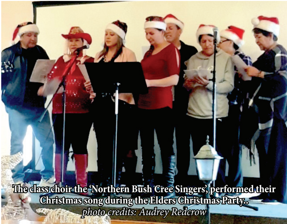
The class choir the 'Northern Bush Cree Singers', performed their Christmas song during the Elders Christmas Party.