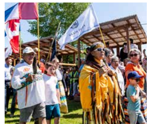
Fort McKay Elders were honoured in the Grand Entry.