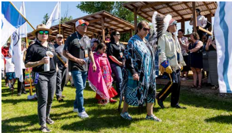
Chief and Council in the Grand Entry parade on June 21.

Also participating were dignitaries from the Government of Canada, the Government of Alberta, and the Regional Municipality of Wood Buffalo.