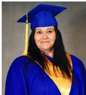
Treasure Grant - Grade 12